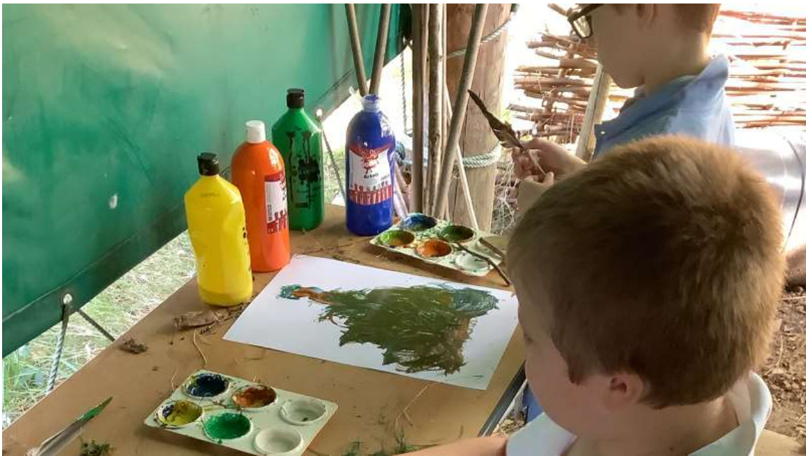
Weekly Forest School for all children

culminating in the award of RHS 5 Star School Garden, Forest School status and The Learning Outside the Classroom QM. 2018-21 has seen a rolling programme of classroom refurbishment and redesign and the creation of the Sunshine Room- a low arousal group activity space . These developments have had a very positive impact on our aim to create a SPELL environment [Structured, Positive, Empathetic, Low arousal, Links [NAS] within which our children can, and do thrive.