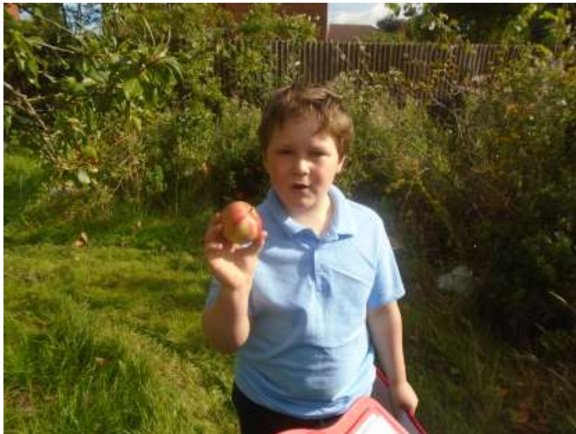
RHS 5 Star gardens

The curriculum offered at Gosberton House Academy is designed around the requirements of the National Curriculum. All Children will work within the National Curriculum at levels appropriate to meet their individual needs. Teaching and learning strategies are adapted to meet personal learning styles. Teaching of English, Maths and Science and other subjects of the National Curriculum are made more meaningful to the children by relating them to themes and interests. Individual learning objectives are planned and progress carefully monitored. The Academy has played an important part in the East Midlands Pupil Participation Project. The Academy has been National Autistic Society Accredited since 2003.